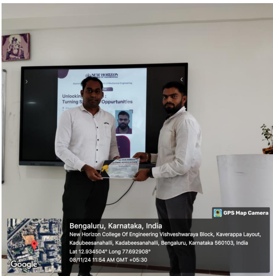
Fig: Glimpse of the Lecture