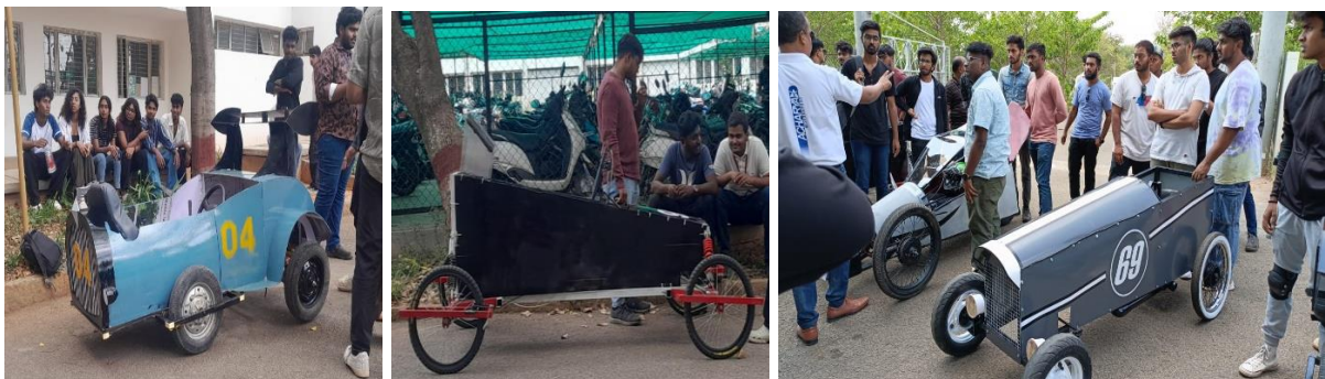
Some of the uniquely crafted designs of the participants.

Soap Box Racing is not just about speed; it's a celebration of innovation and design. Each team designs and builds their own gravity-powered vehicle, pushing the boundaries of creativity and engineering. Each team poured countless hours into crafting a unique racer, focusing on both functionality and aesthetics.