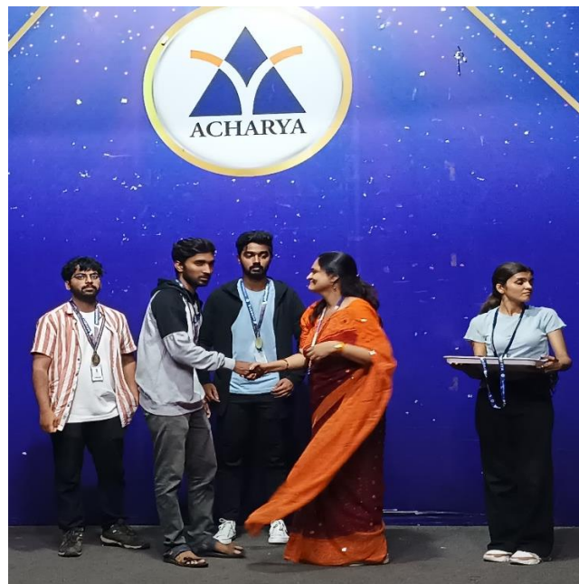
The team was honoured with the prestigious award for "Best Design Innovation and Creativity."

As we reflect on our experience, we're grateful for the opportunity to showcase our skills and represent our college. Soap Box Racing isn't just a competition; it's a celebration of ingenuity and teamwork, leaving us inspired to continue pushing the boundaries of innovation.